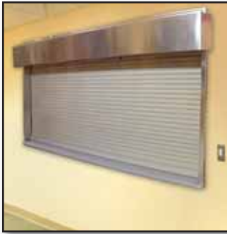
Protected by US Patent #6,155,324

Concealed in the Counter Fire Door's shaft assembly, M100 FireGard Tube Motor Systems are ideal for openings with tight clearances around the coil area or to neatly conceal the operator and drive components, avoiding the need for bulky covers. Safe and reliable Cornell M100 FireGard Tube Motor Operators automatically close Counter Fire Doors without releasing spring tension or disengaging the operator drive mechanism, providing simple automatic closing system testing and resetting.